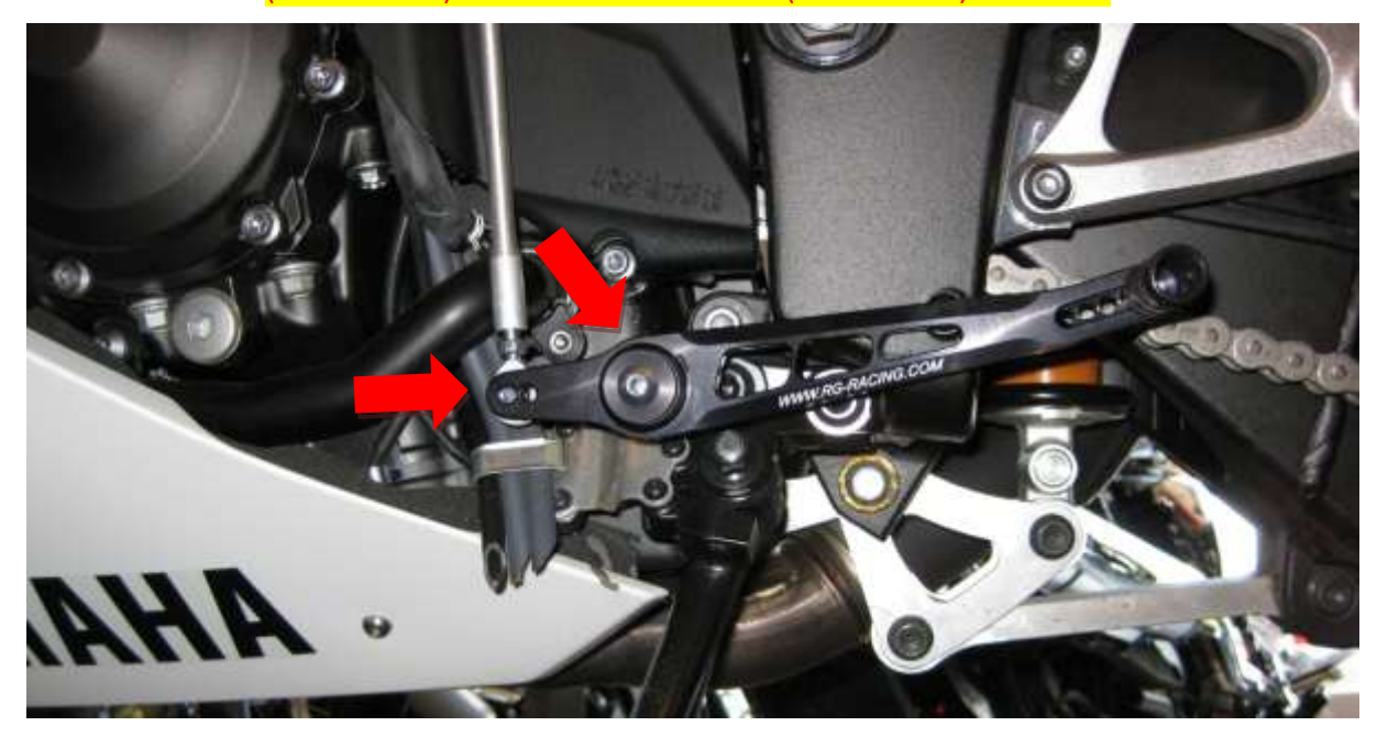
Then install the footrest, find the right position and screw them tight.

PLEASE NOTE ON THE 2013 MODEL YOU WILL NEED TO USE THE LONGER M8 BUTTON HEAD BOLT (80mm LONG) AND THE EXTRA SPACER (20mm WIDE) SUPPLIED.