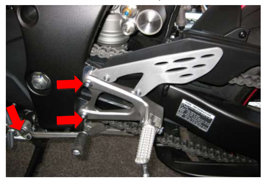
Enlever le train arriered'origineet le levier de vitesses, maisgarderl'arbre de transmission d'origine et le connecteurboite de vitesses.