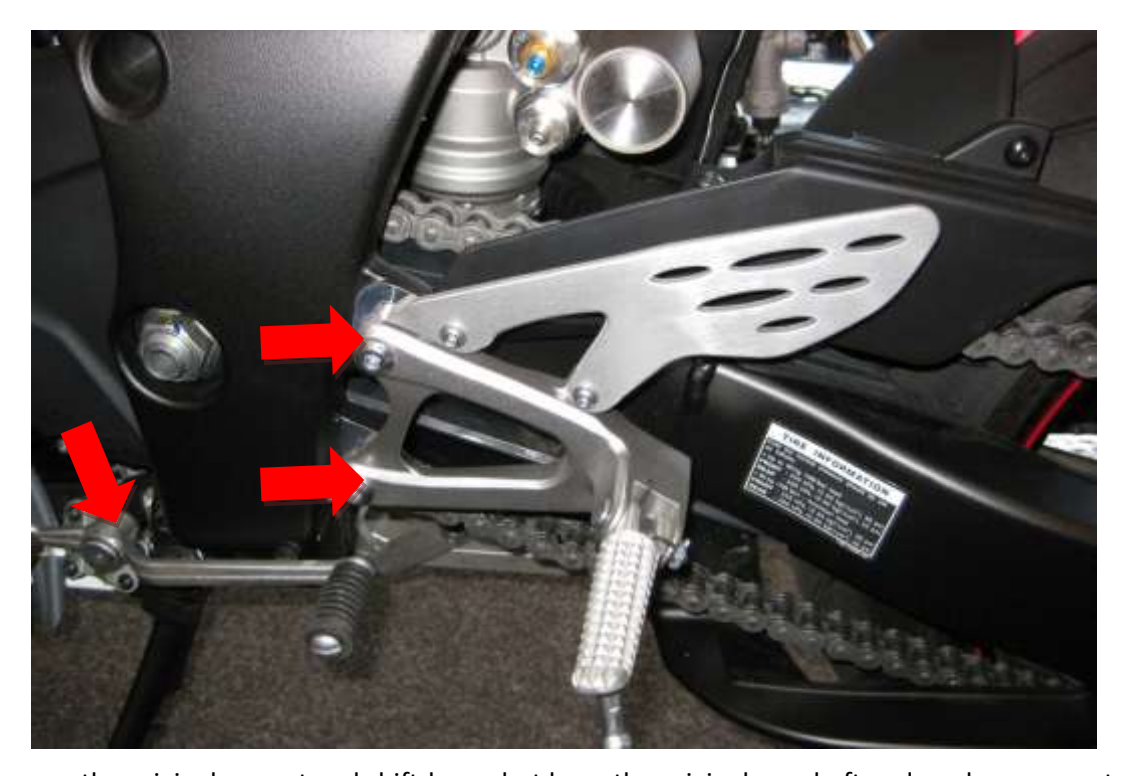
Remove the original rearset and shift-lever, but keep the original gearshaft and gearbox-connector.