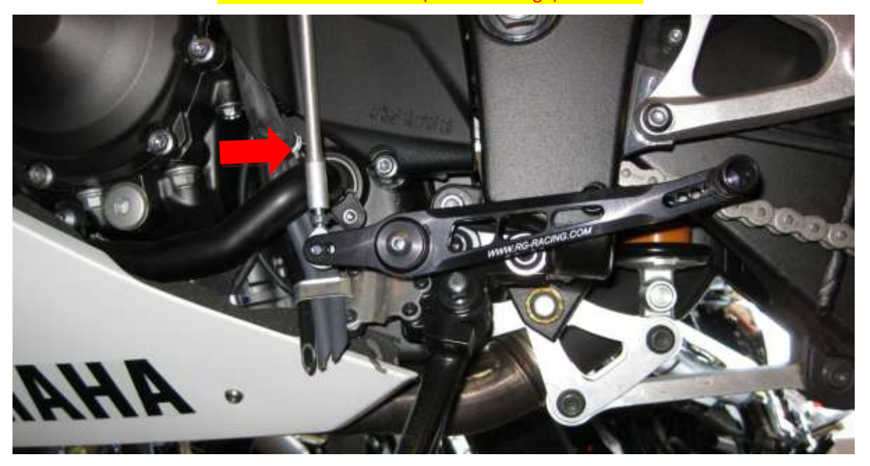
Installer le repose pied, trouver la bonne position puisserrer.

NOTE: SUR LE MODELE 2013 VOUS DEVREZ UTILISER LE BOULON M8 LE PLUS LONG (80mm de long) ET L'ENTRETOISE LARGE (20mm de large) FOURNIE.