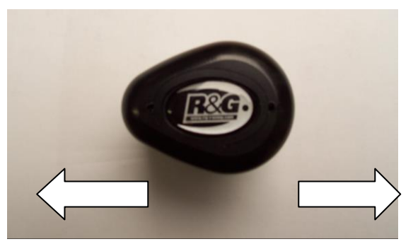
REAR OF BIKE